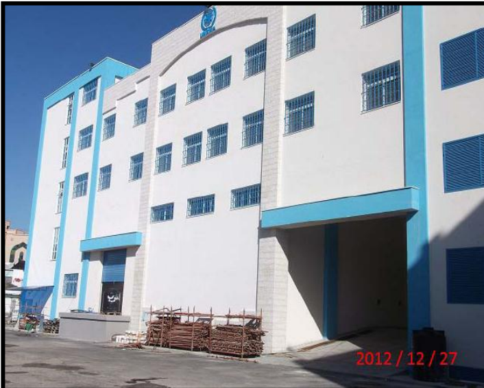
The reconstruction of UNRWA headquarters