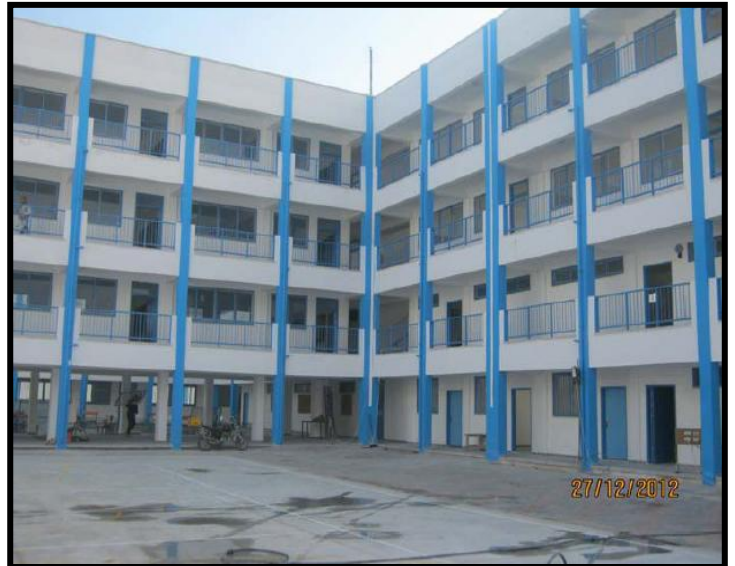
A new school construction in Al-Maghazi